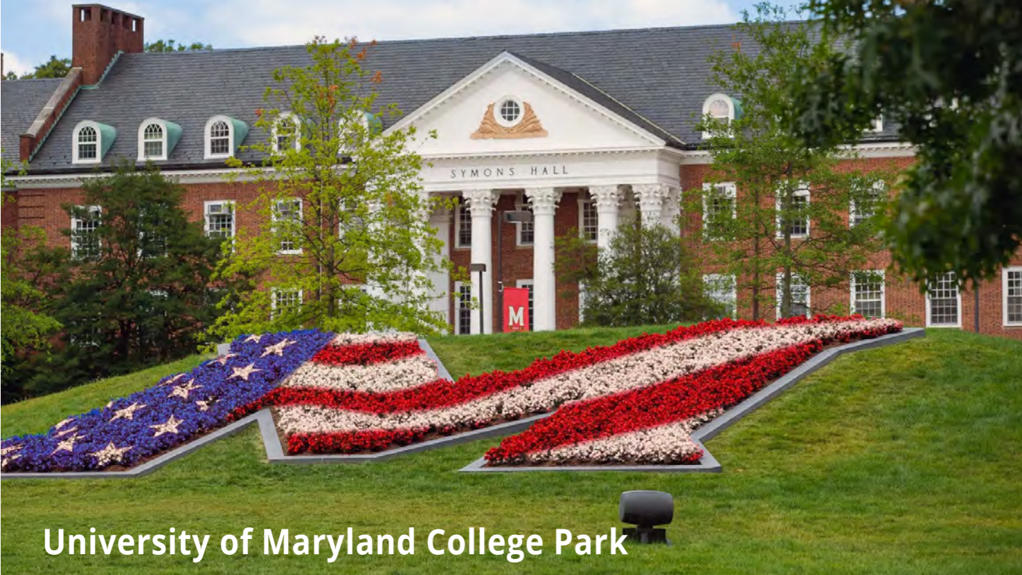
University of Maryland College Park