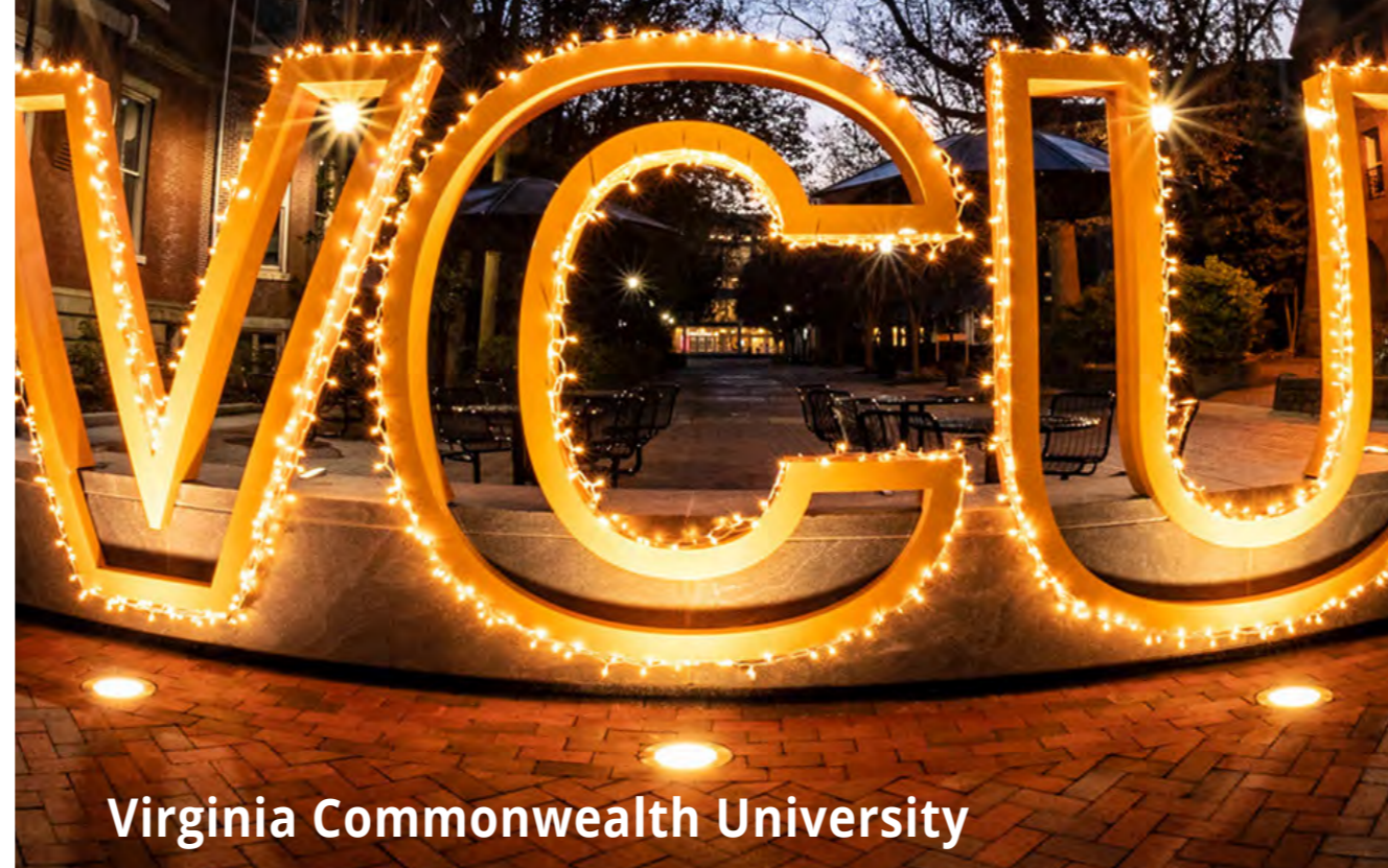
Virginia Commonwealth University