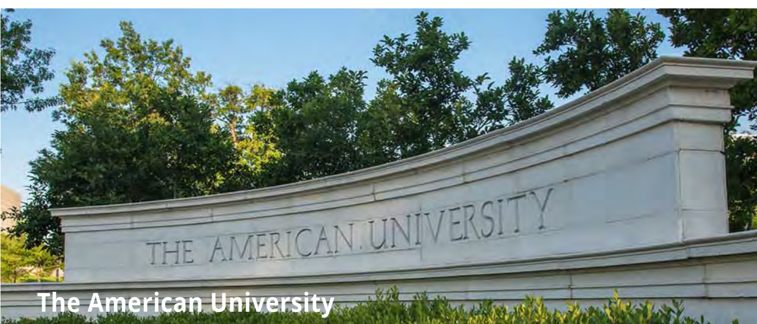
The American University