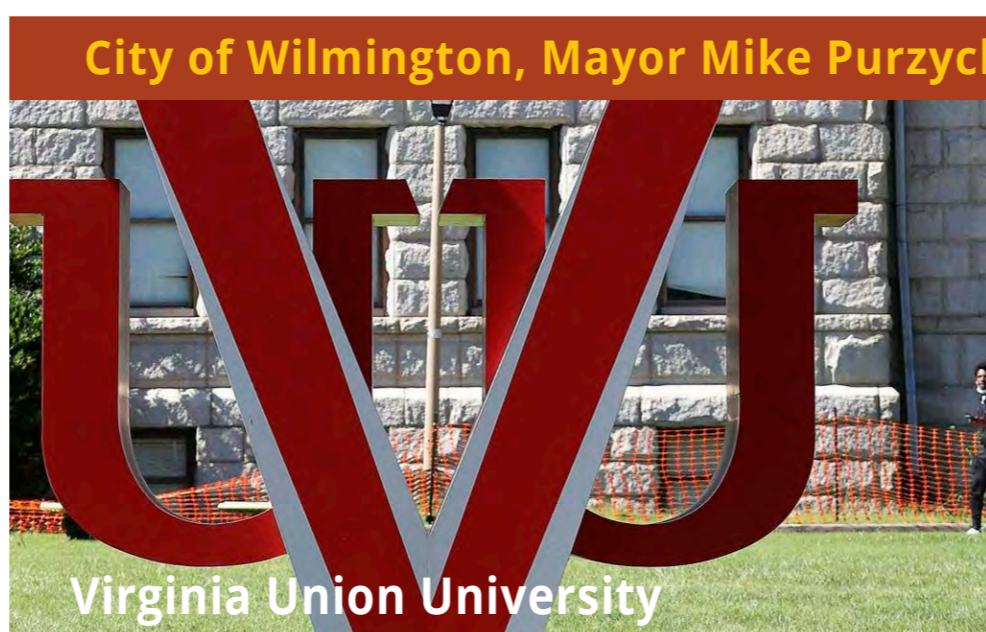
Virginia Union University